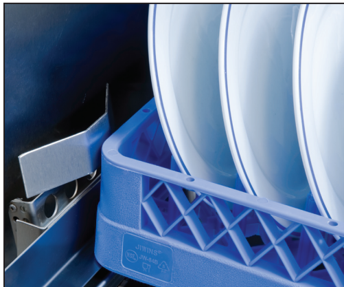
RackAware™ Automatic Rack Sensing System* only runs a cycle when a rack is present